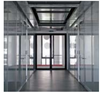
SECOND AND THIRD FLOORS